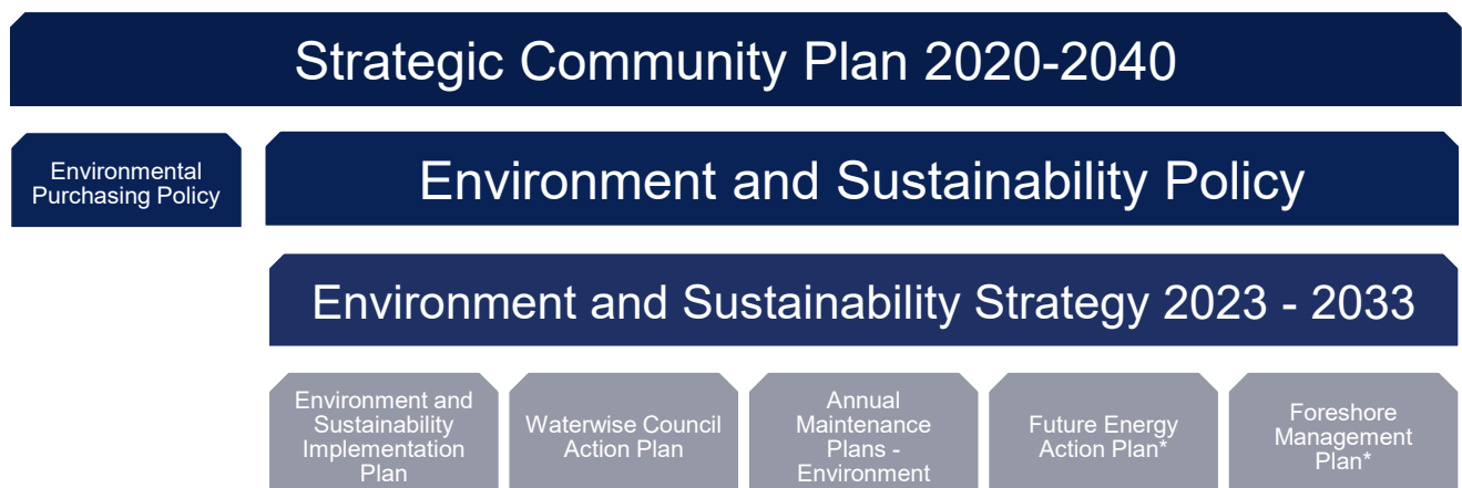
Figure 1 Components within the City's Environmental Management System. *Proposed to be developed.