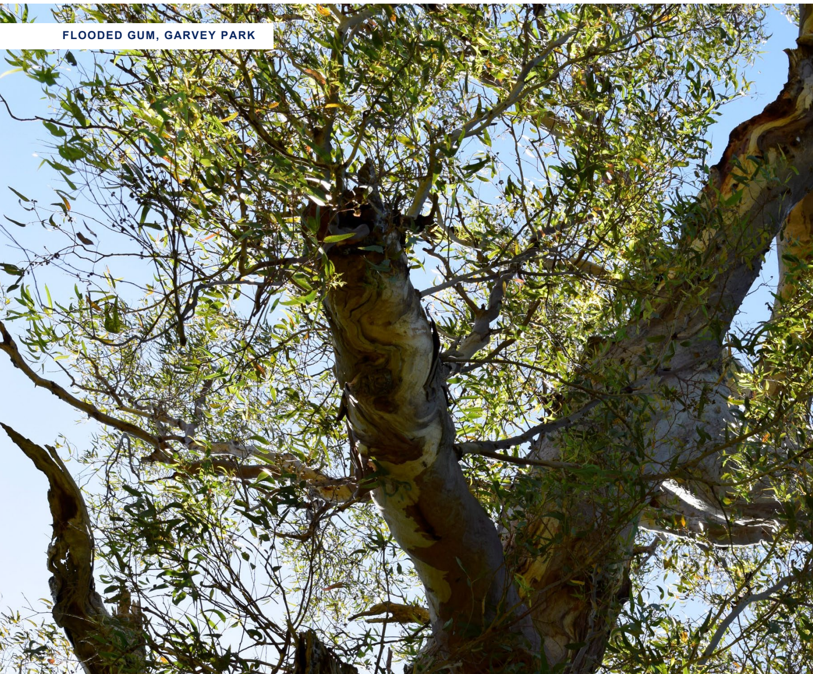
FLOODED GUM, GARVEY PARK