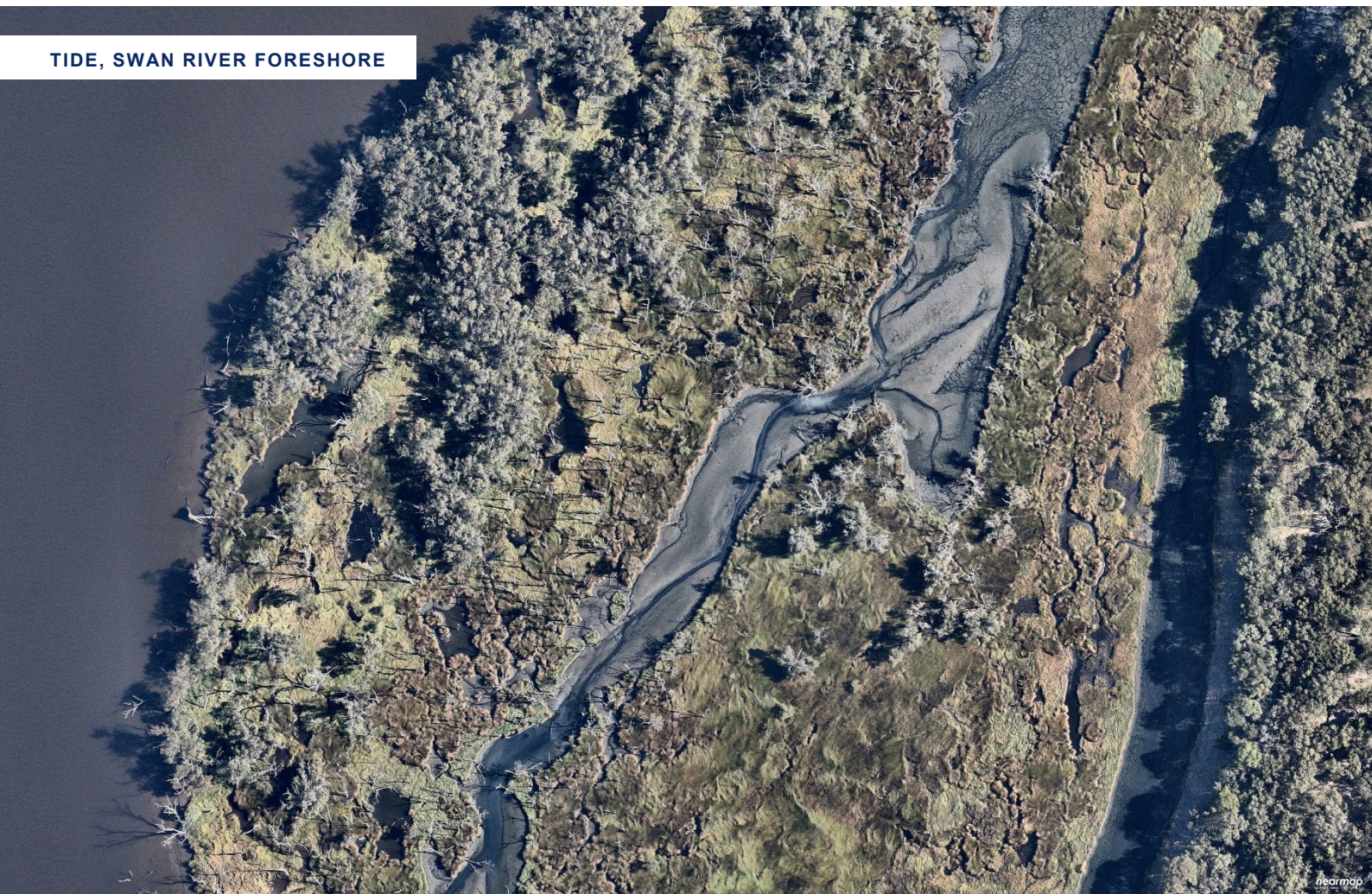
TIDE, SWAN RIVER FORESHORE