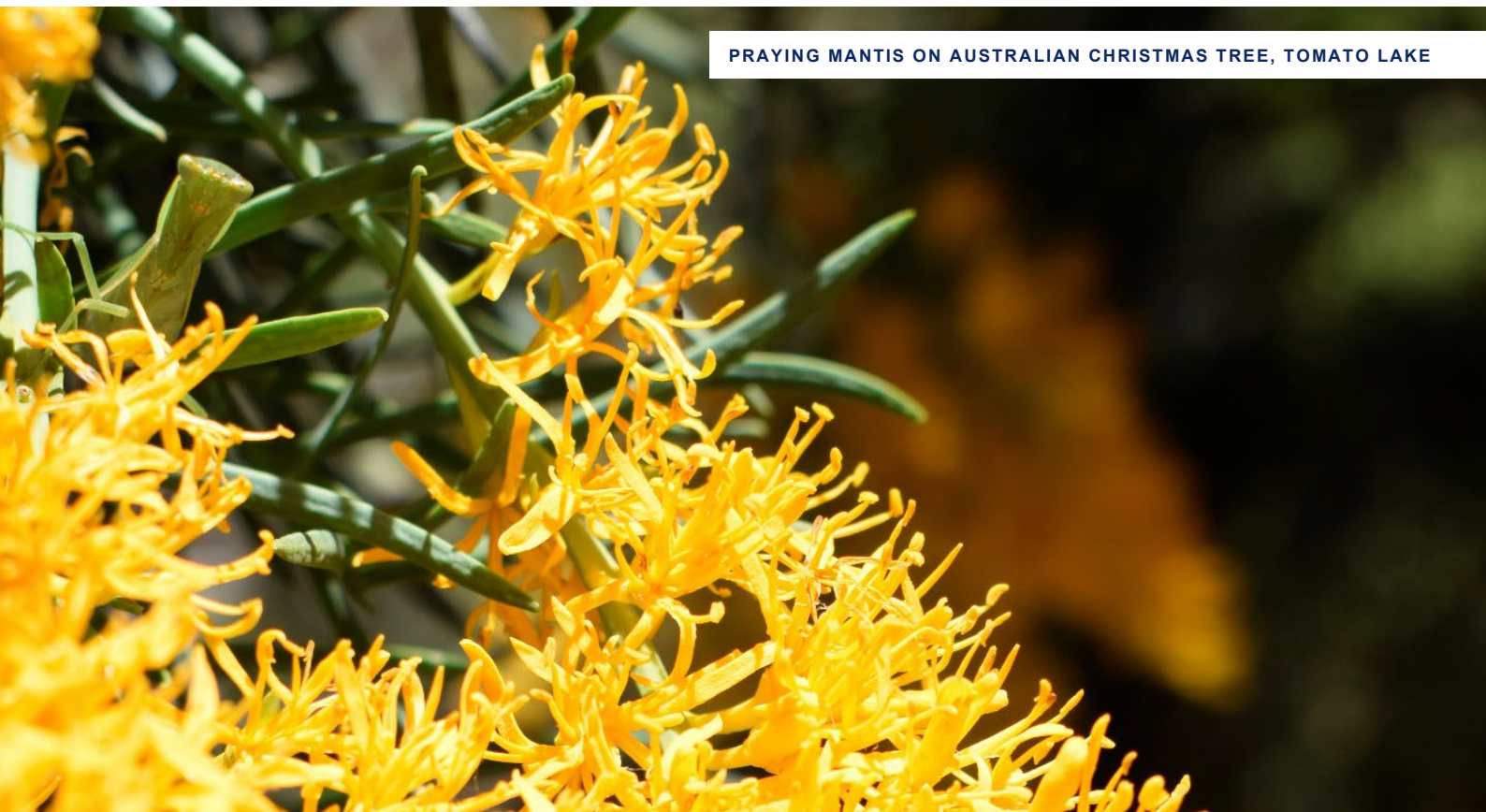
PRAYING MANTIS ON AUSTRALIAN CHRISTMAS TREE, TOMATO LAKE